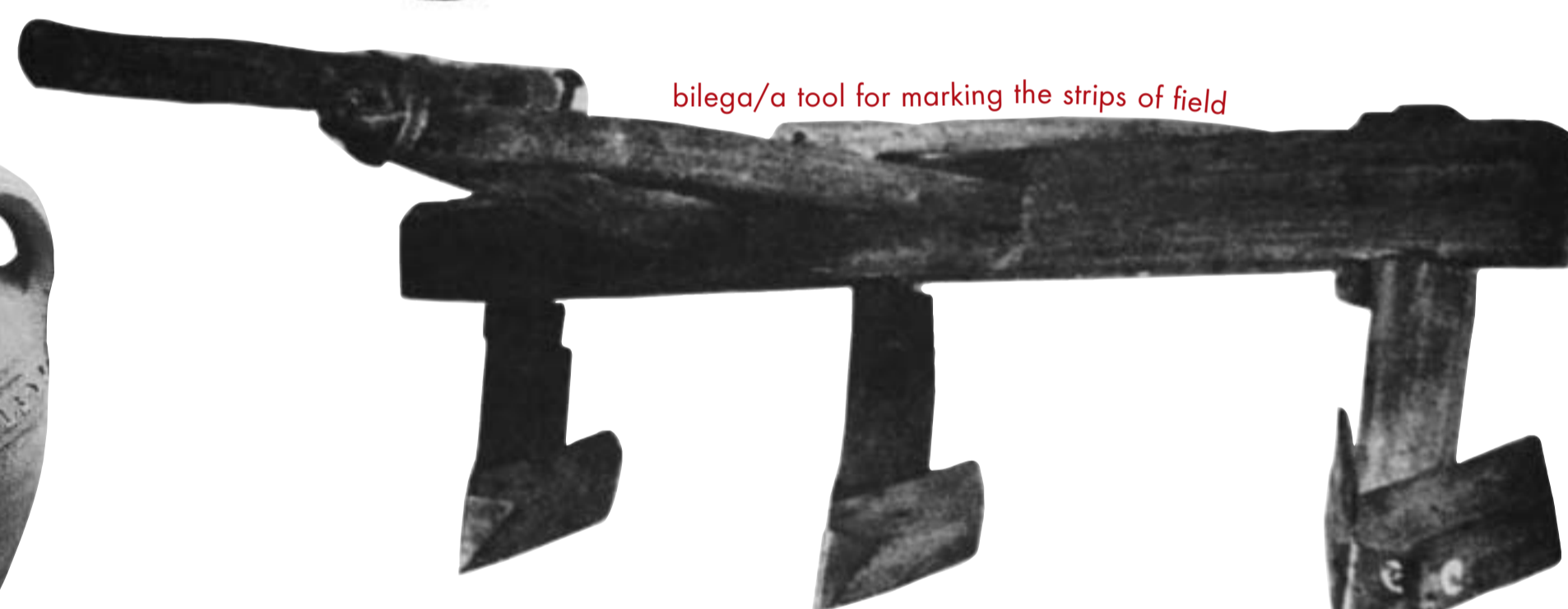
bilega/a tool for marking the strips of field