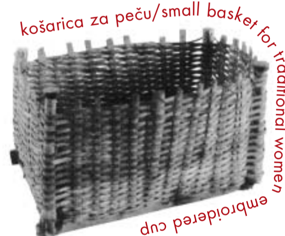
košarica za peču/small basket for traditional women embroidered cup