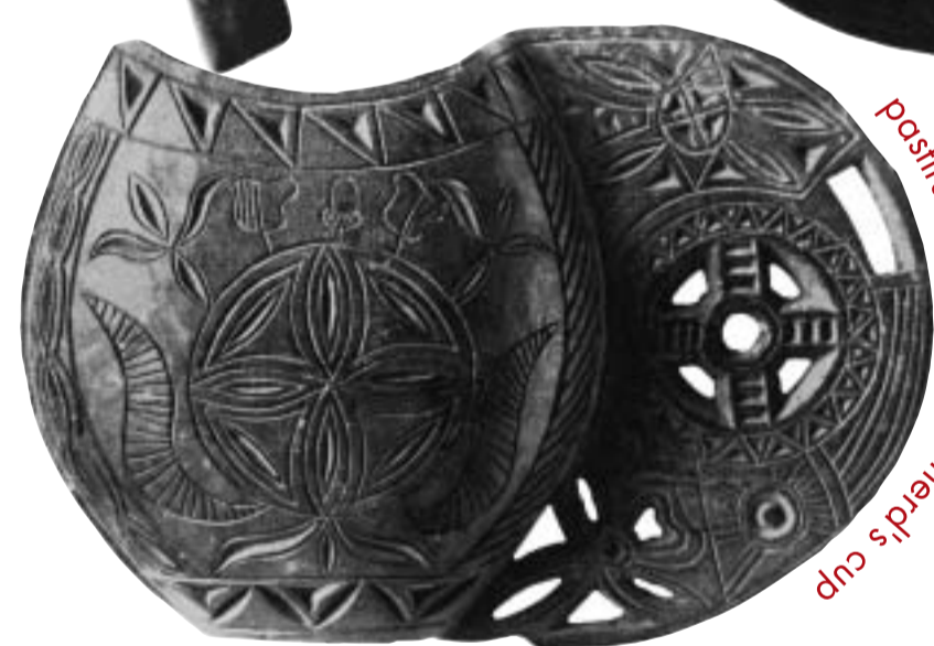
pastirski čas/a shepherd's cup