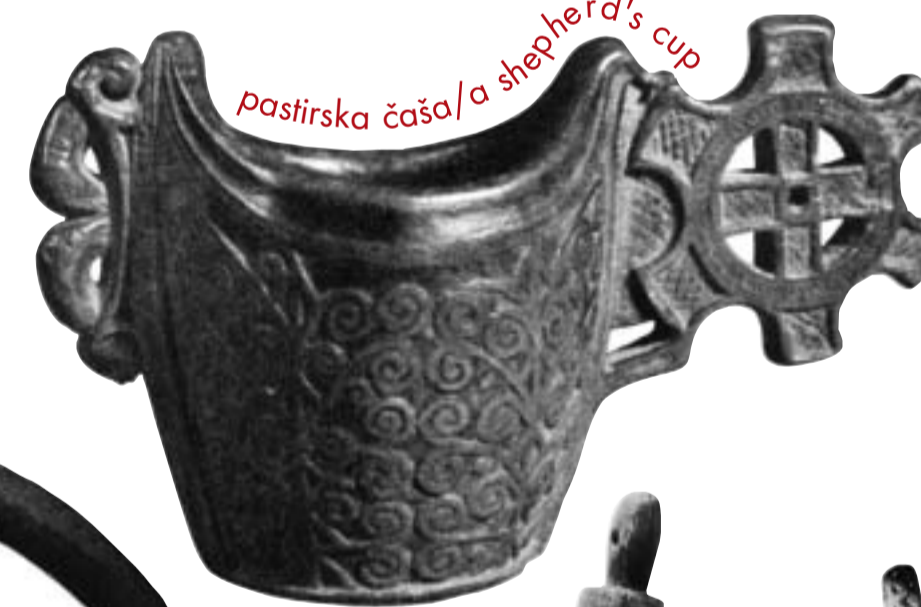
pastirska čaša/a shepherd's cup