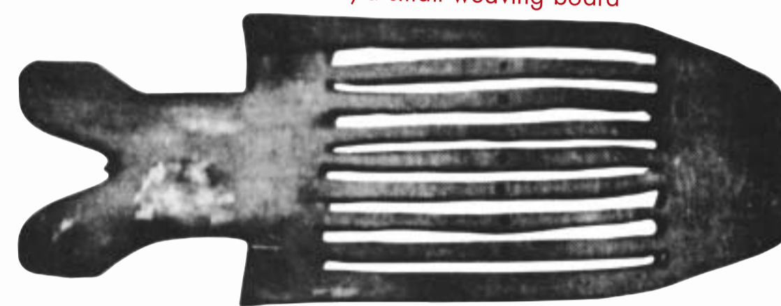
deščička/a small weaving board